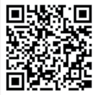
Aragon Reserve Woods