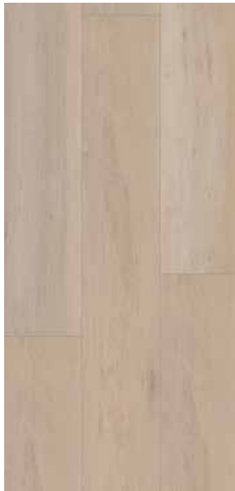
Warm Oak 6566AR