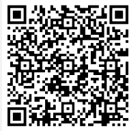
Hybrid Flooring Care & Maintenance

Flooring Distributors of Australia sales@fda.net.au www.fda.net.au