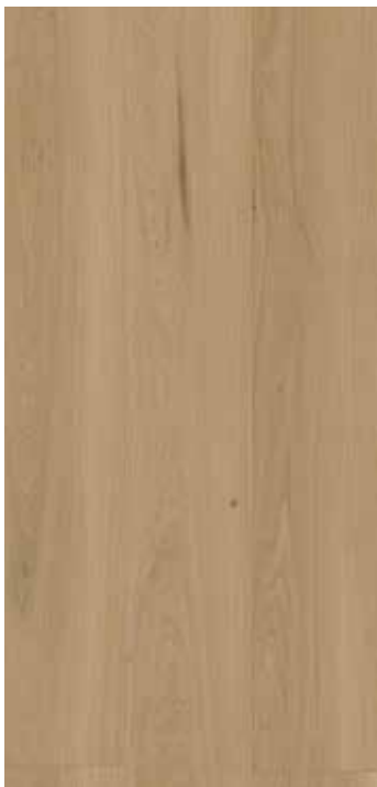
Alpine Ash 6565AR