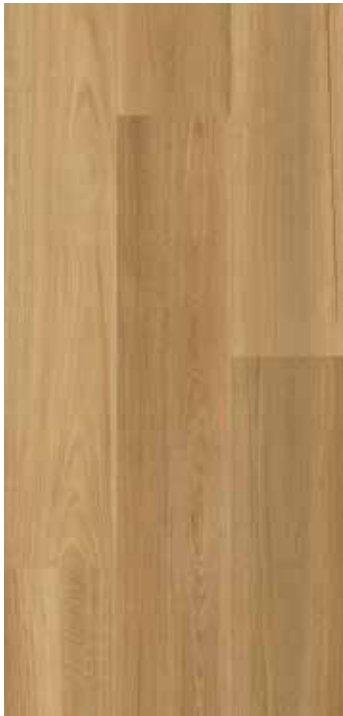
Classic Natural Blackbutt 6568AR