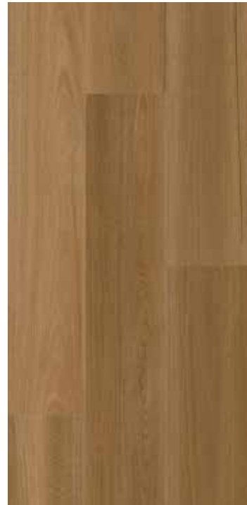
Majestic Natural Blackbutt 6570AR