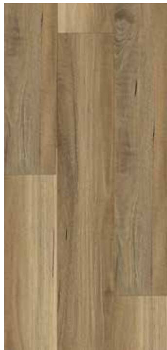
Australian Spotted Gum 6507AR