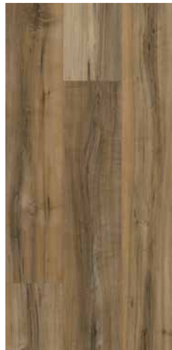
Southern Blue Gum 6506AR