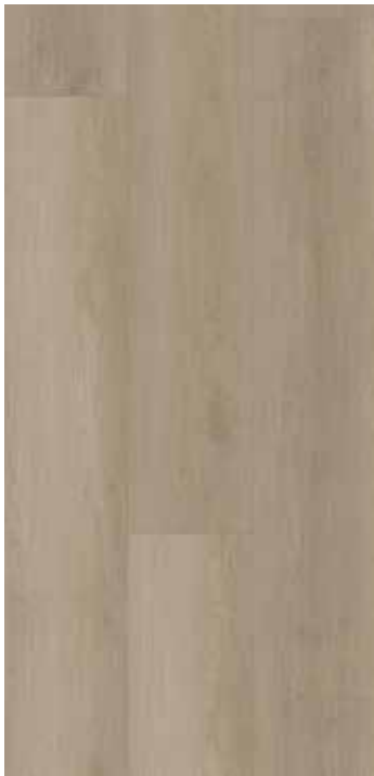
Beach Oak 6564AR