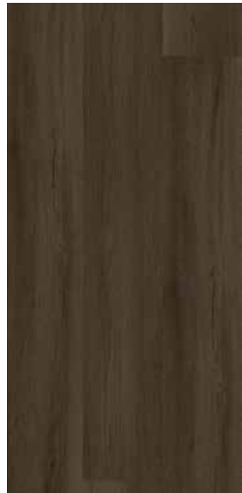
Blackwood Oak 6567AR