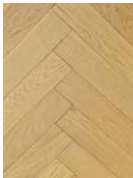
Tomki Product Code: HW022RZ