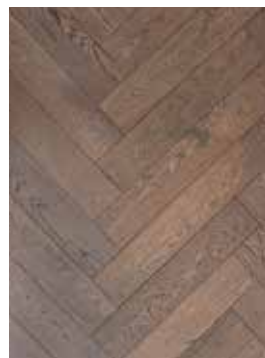
Empire Product Code: HW006RZ