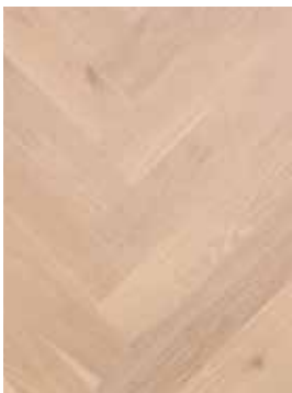
Hastings Product Code: HW012RZ