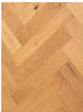
Ballina Product Code: HW002RZ