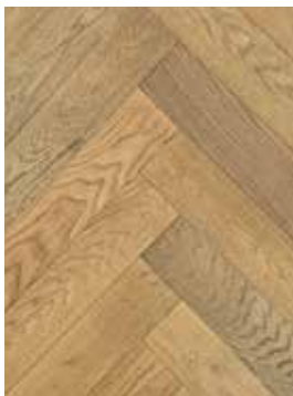
Clunes Product Code: HW021RZ