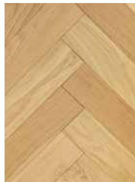
Springbrook Product Code: HW023RZ