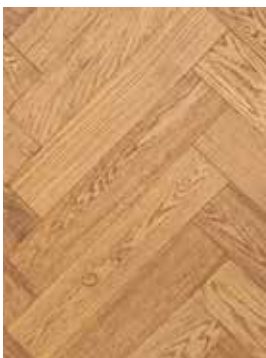
Wardell Product Code: HW001RZ