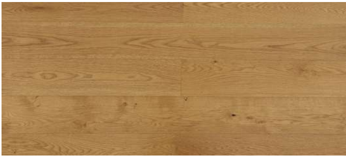
COUNTRY OAK 001