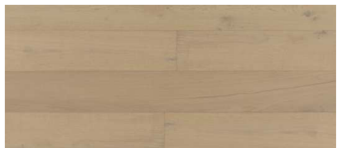
PALE OAK 008