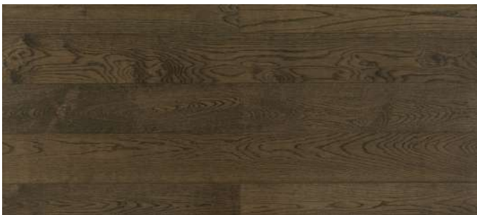
GREY STONE 003