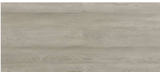
SILVER ASH 007