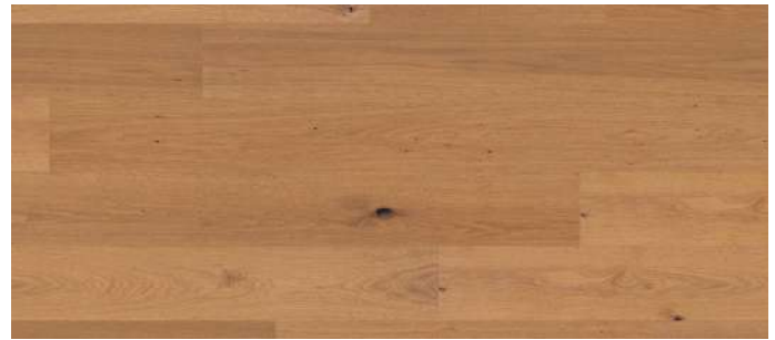
CLASSIC OAK 002