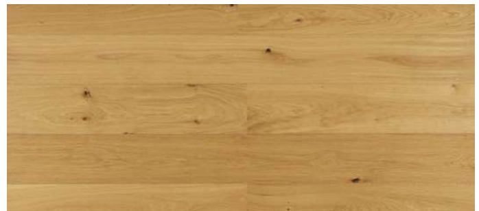
NATURAL OAK 004