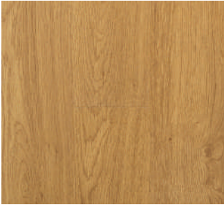
● Brazilian Oak