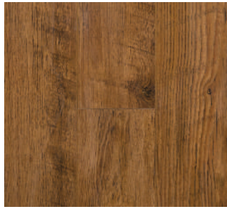
● Antique Oak