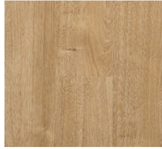
● European Oak