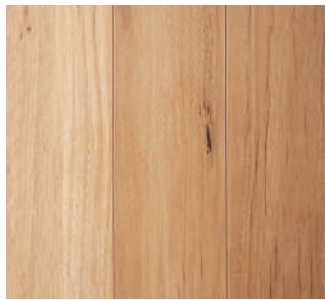
● XL Blackbutt