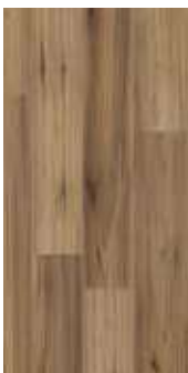
Fairhaven Product Code: 916