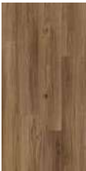
Rustic Spotted Gum Product Code: 911