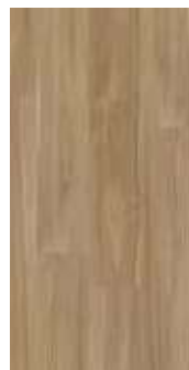
Parker Hill Product Code: 918