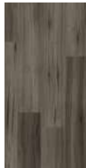
Bancoora Product Code: 914