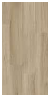
Kennett Product Code: 917