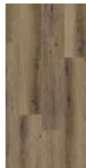
Gables Product Code: 9120

PLANK SIZE: 1830 x 230 x 7mm BOX (6pcs): 2.1sqm