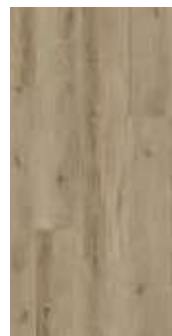
Airlie Product Code: 919