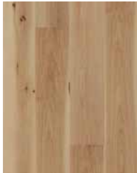
Hickory Product Code 706