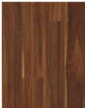
Blackwood Product Code 703