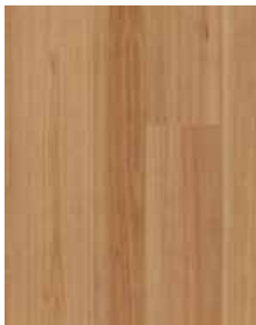
Blackbutt Product Code 702