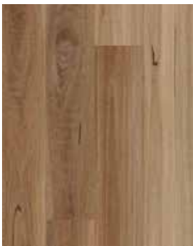
Spotted Gum Product Code 701