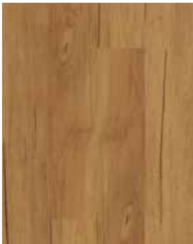
Marri Product Code 704