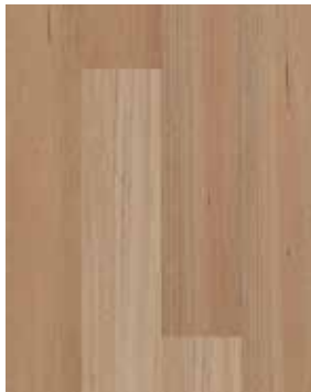
Tasmanian Oak Product Code 705