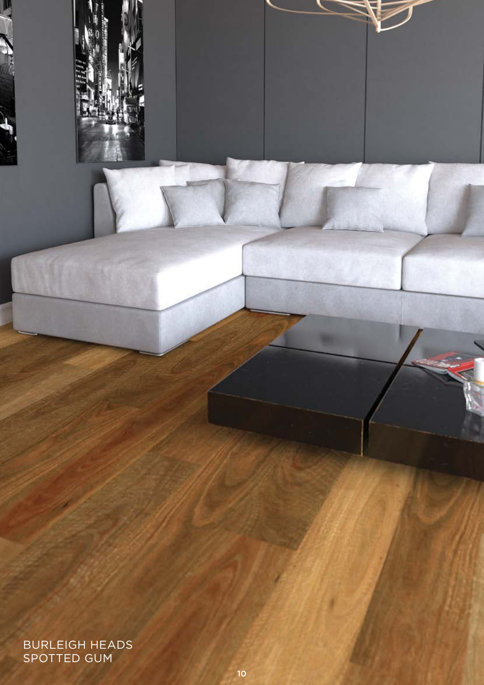
BURLEIGH HEADS SPOTTED GUM