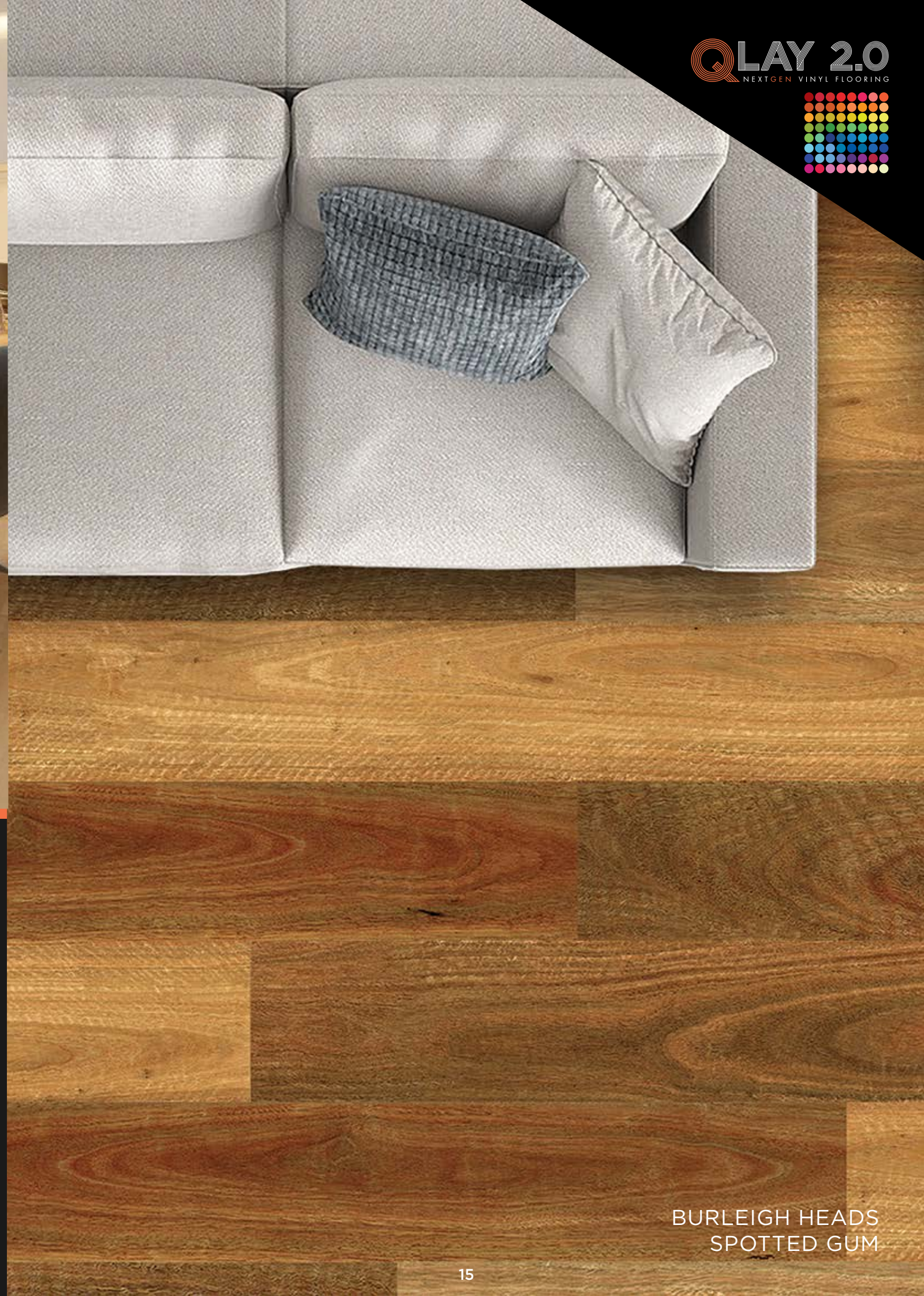
BURLEIGH HEADS SPOTTED GUM