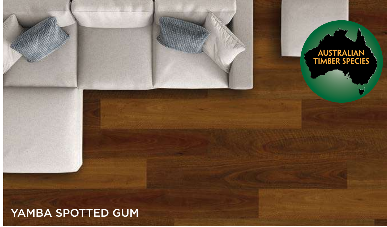
YAMBA SPOTTED GUM