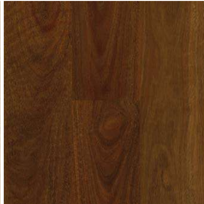
YAMBA SPOTTED GUM