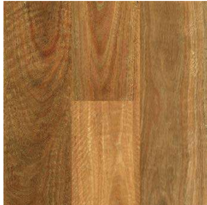
BURLEIGH HEADS SPOTTED GUM