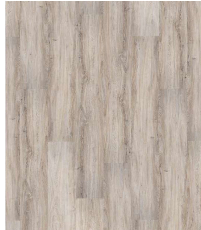
Riverland - Limed | 3X111907