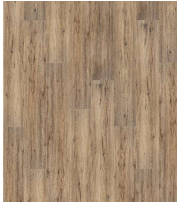
Barnwood - Ombre | 3X102605

Colour swatches may vary between digital brochure to real life product and are to be used as a guide only - refer to our Colour Variation Factsheet . It is recommended you view the actual product in store - visit our Store Locator .