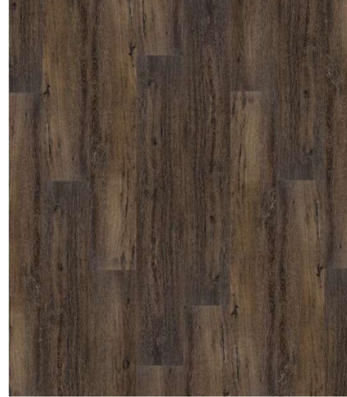
Valley Oak - Haze | 3X109508