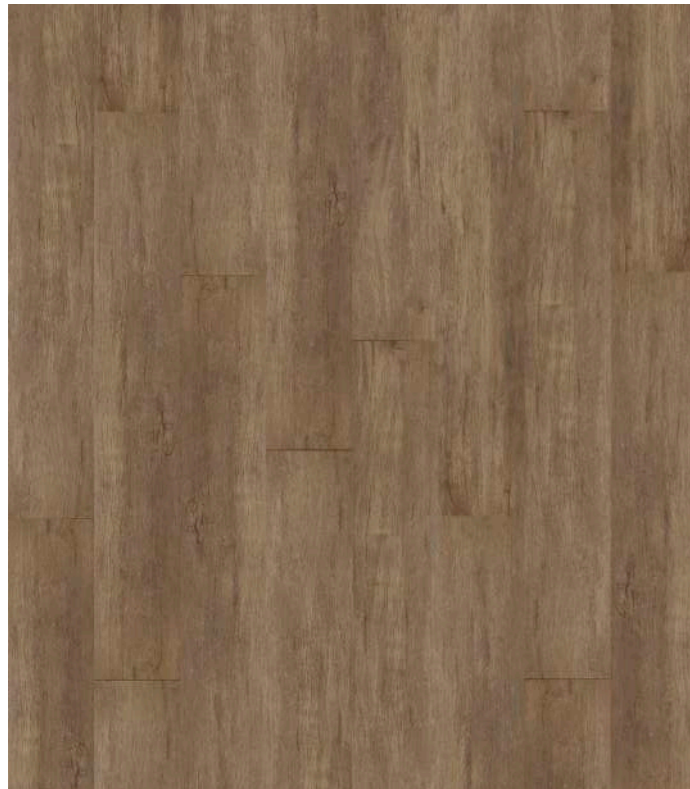
Barnyard Grey | 3X168011