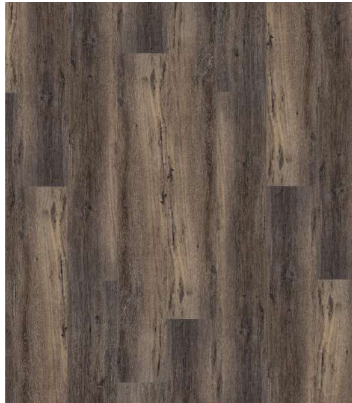
Valley Oak - Mist | 3X109505