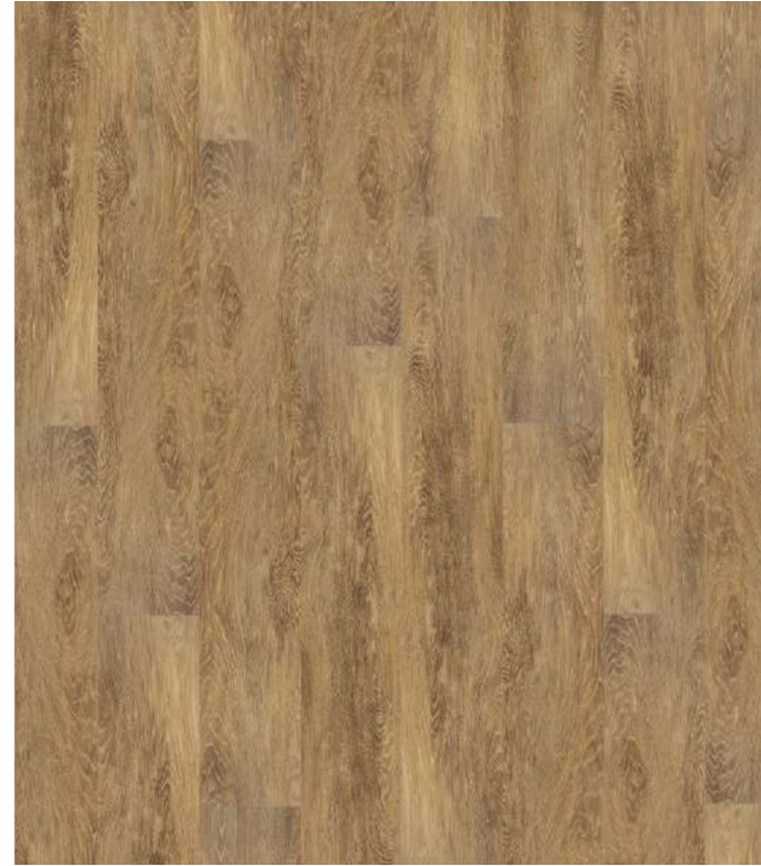
Oak - Harmony | 3X057015