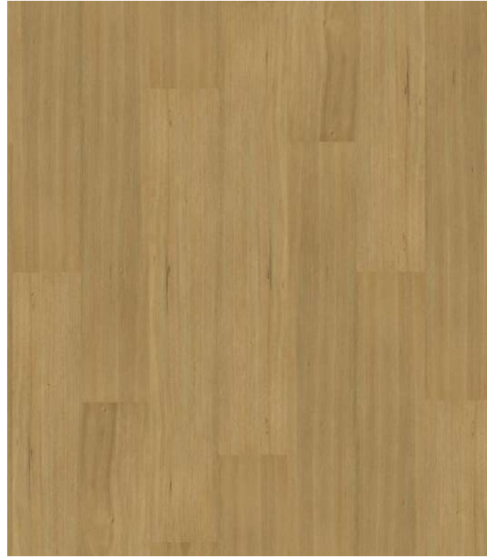
Tasmanian Oak | 3X388801