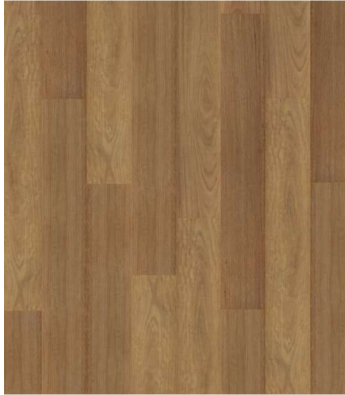
Blackbutt | 3X388901