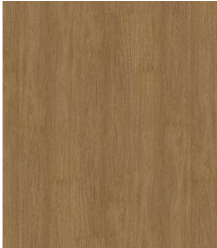
Spotted Gum | 3X389001