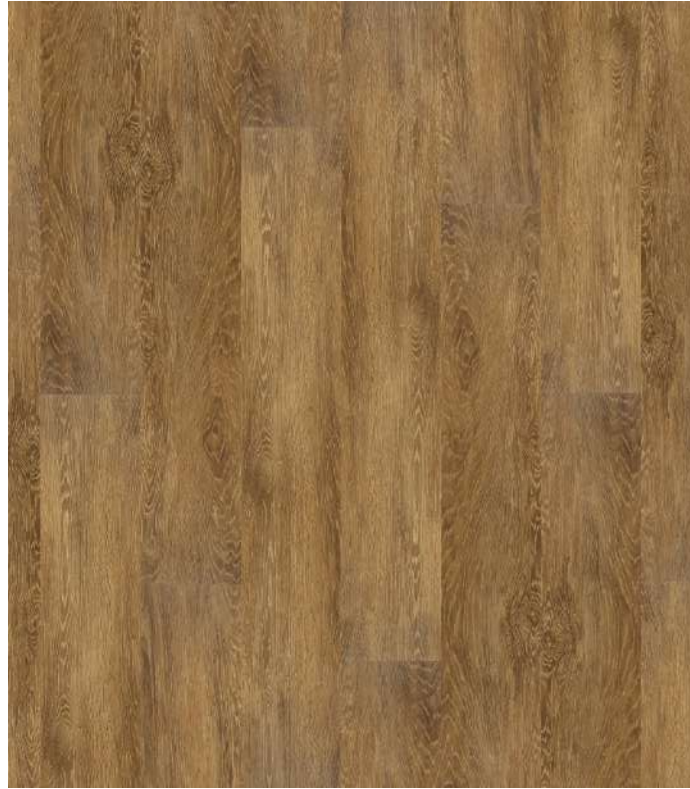
Oak - Tranquil | 3X057014

Natural Creations™ XL 1500 x 230 x 5.0 mm