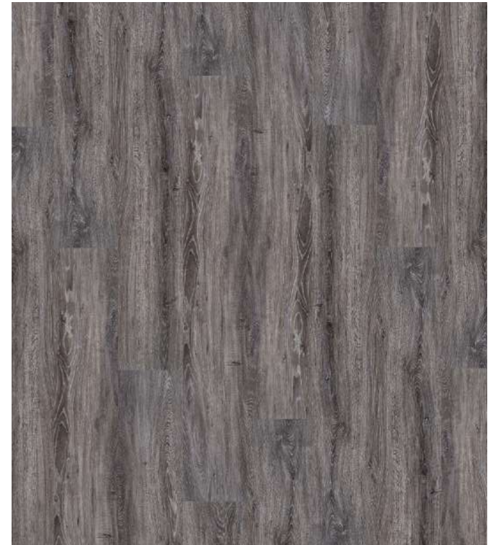
Riverland - Ash | 3X111903