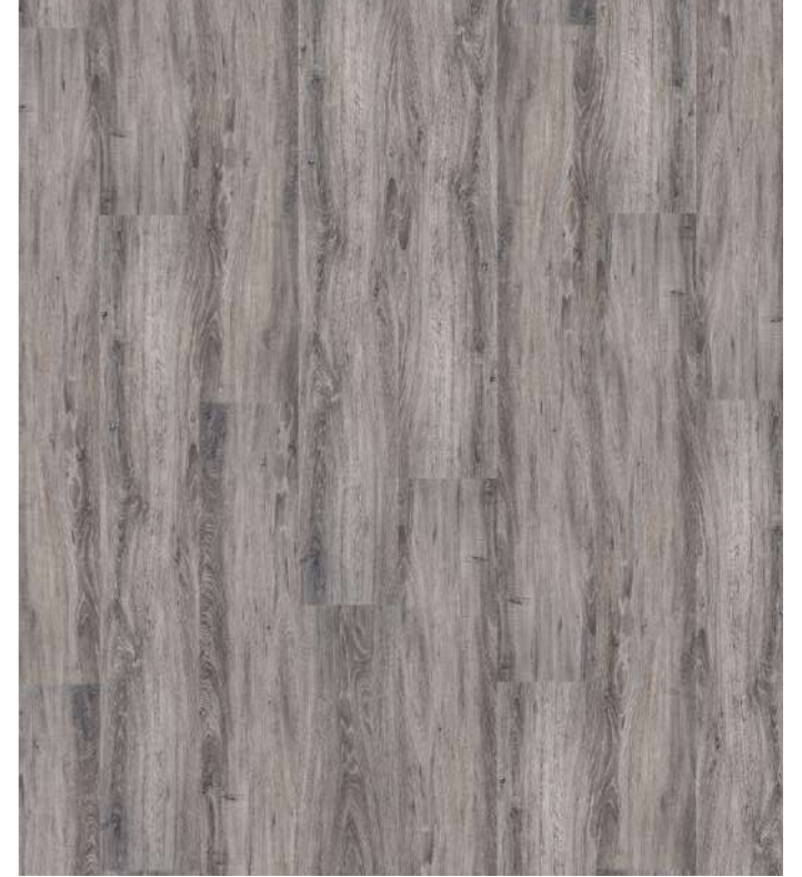
Riverland - Smoke | 3X111906